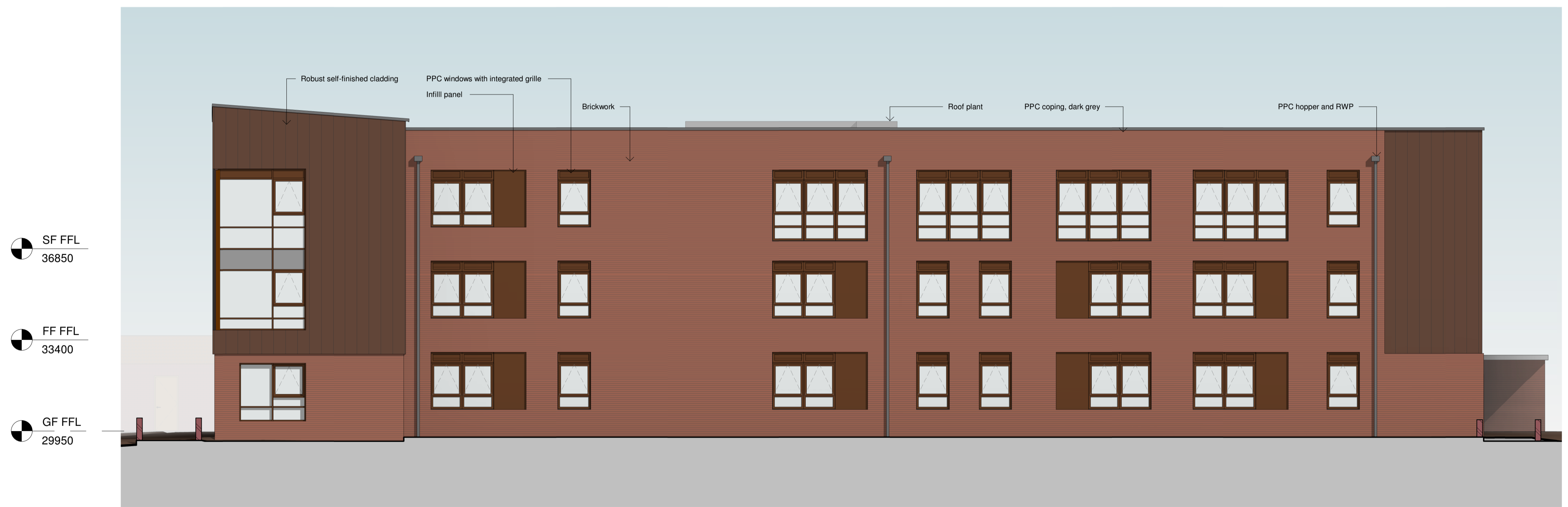
Proposed North Elevation 1 : 100

Note: Do not scale this drawing. All levels and dimensions are to be checked on site. This drawing is to be read in conjunction with all relevant consultants' requirements, drawings and specifications. Any discrepancies between consultants' drawings to be reported to the Contract Administrator before any relevant work commences. Copyright: 2012 Miller Bourne ©